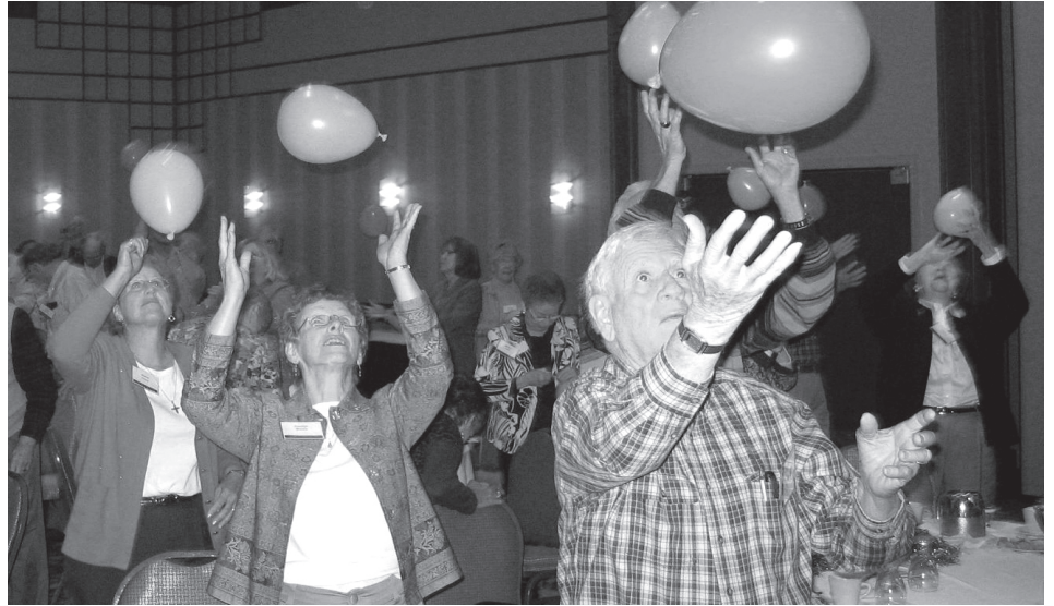
Attendees participated in a variety of physical activities at the Purposeful Living Conference.